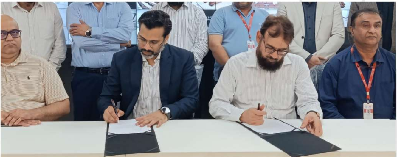
Silicon Enterprise Solutions is proud to announce the formal sign-off of the "Surveillance Project – Indus Hospital & Health Network".