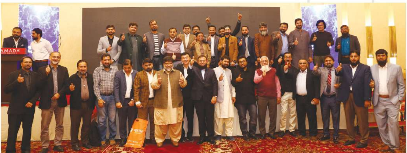
Silicon Enterprise conducts a Vertiv Channel Partner Event at Ramada Hotel Lahore. Thanks to all our valued customers for taking their precious time for this event.