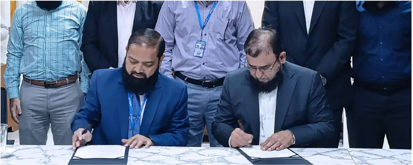
A proud moment for Silicon Enterprise Solutions as we officially completed and signed off the "Integrated Connectivity Infrastructure Project" at PSPC.