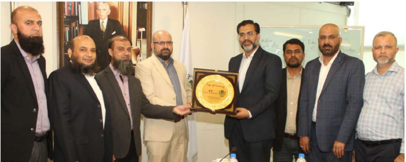
Silicon Enterprise Solutions proudly marked the official sign-off with SECP for the Data Centre Revamp Project in Lahore and Islamabad