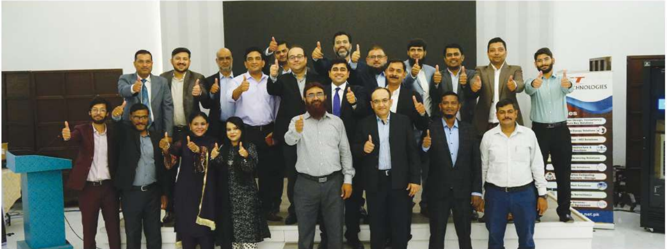
Silicon Enterprise successfully organized the Vertiv Channel Partner event for our business partners where modern technologies related to power management solutions and data center solutions were presented and discussed.