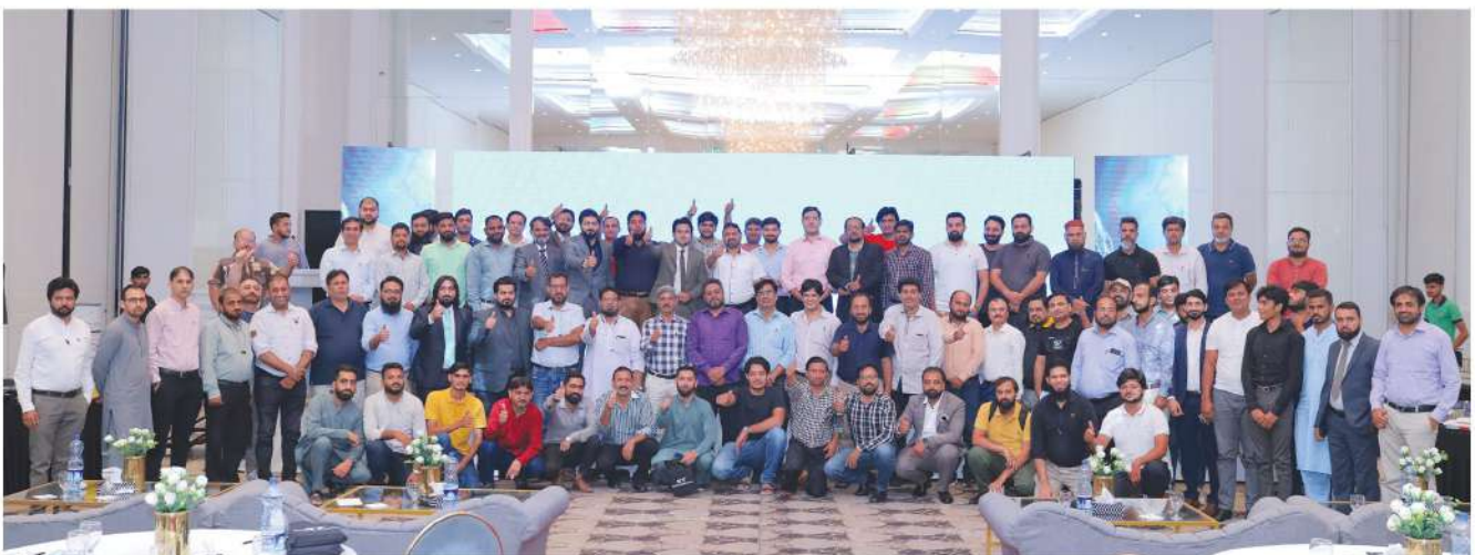
Silicon Enterprise conducts a Dlink Channel partner event at Nishat Hall Lahore. Thanks to all our valued customers for taking their precious time for this event.